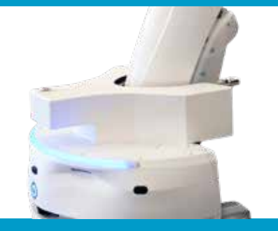
Unique co-bot functionality that takes over repetitive tasks.