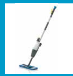
Powerful robotic cleaning with i-walk Precision cleaning with the i-mop XL Spot cleaning with the i-fibre Pro