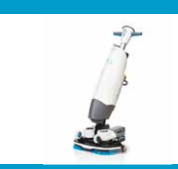
Compatible with all i-mop XL models from 2014 onwards.