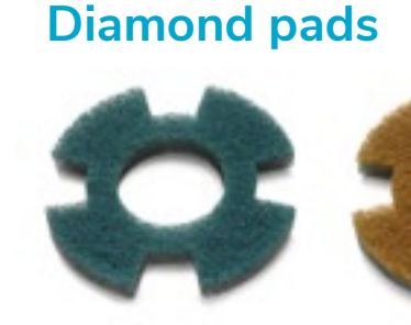
0 Twister Green Daily cleaning on stone, concrete, ceramic, vinyl, timber, rubber floors.